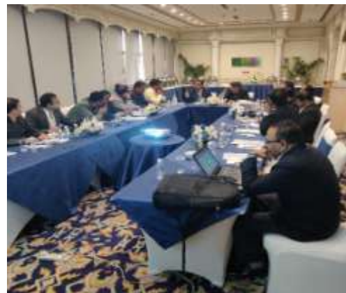
6 th Governing Body Meeting on 10 th January, 2020