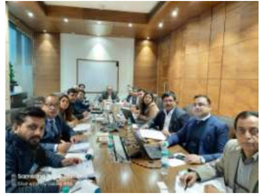
ACFI Regulatory Meeting on December 30, 2019