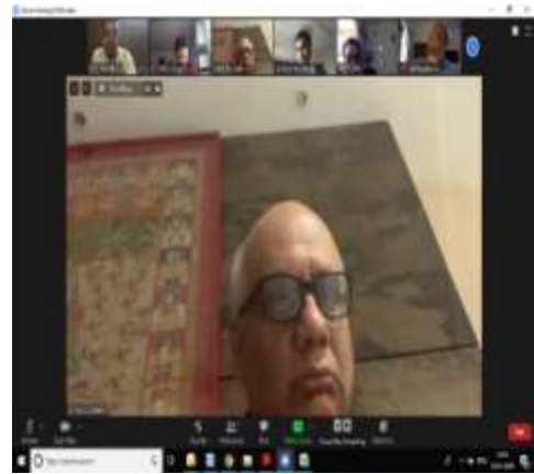
VC Meeting on important Industry Issues (9 (4) TI_Consent Form) May 19, 2020