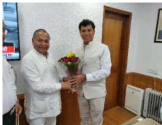
Meeting with Shri Kailash Chaudhary, Hon'ble Minister of State, Ministry of Agriculture & Farmers Welfare at his office in Krishi Bhawan on June 12, 2019.