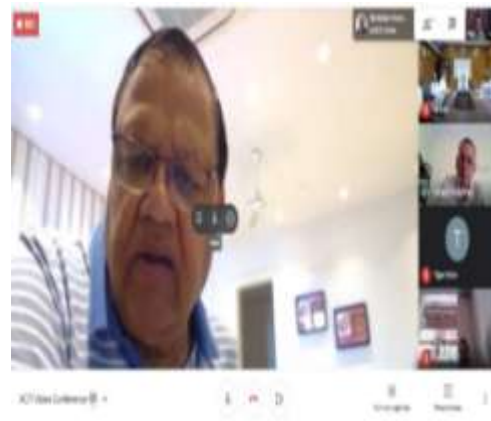
VC Meeting on proposed Ban on 27 Pesticides May 21, 2020